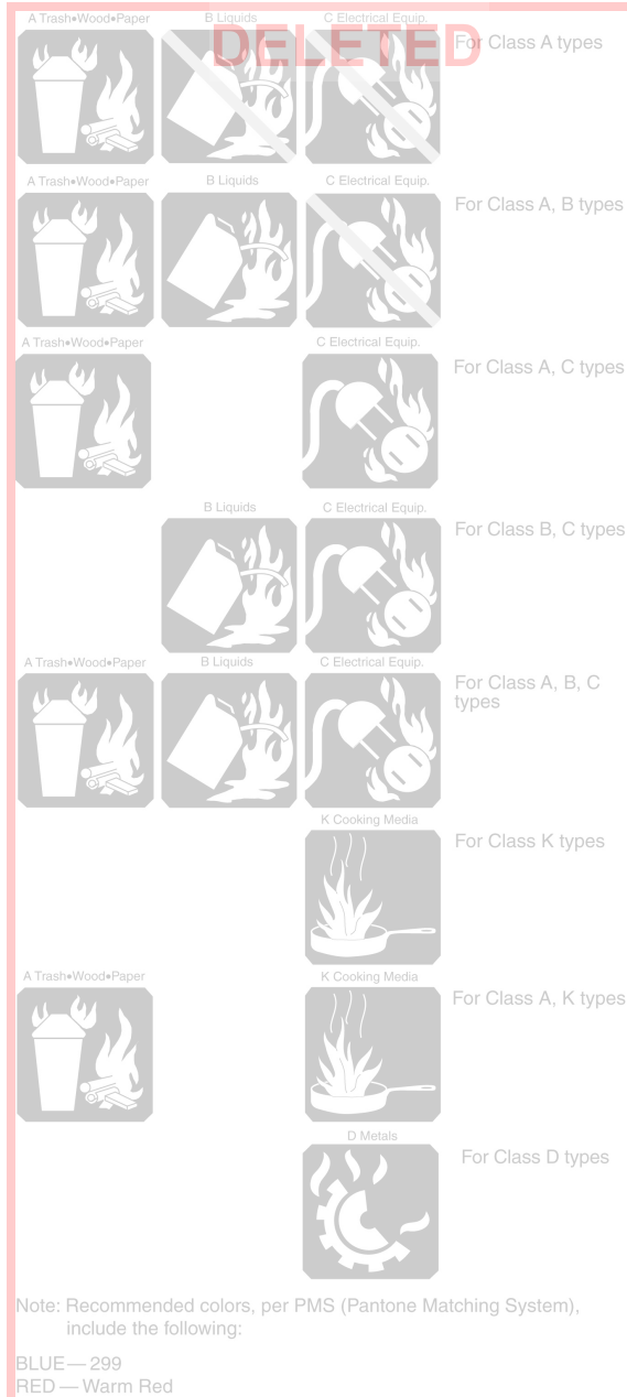
Figure B.1.1 Recommended Marking System.